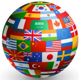
International Languages and Cultures

Stimulating environment of growth-minded people and companies, and access to an exceptional business network